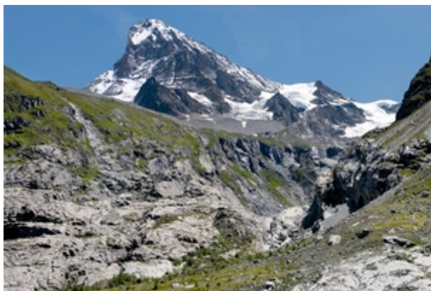
View of the Dent Blanche from the Ferpècle Glacier in 1900 and 2010