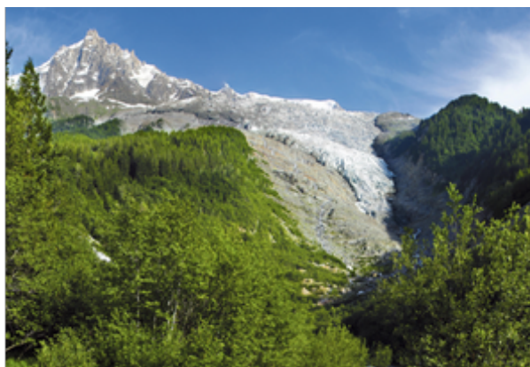
The Bossons Glacier on the northern slope of the Mont Blanc in 1880 and in 2010