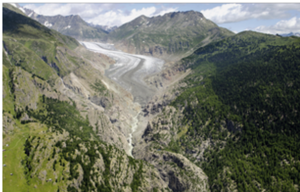
The Aletsch Glacier in 1865 and 2010