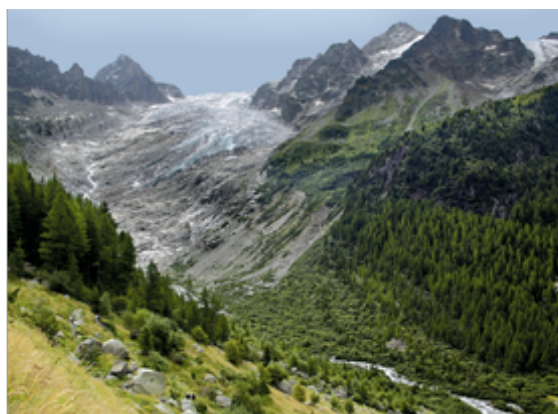
The Trient Glacier in canton Valais has retreated dramatically between 1891 and 2010. It now measures only 4.5km long