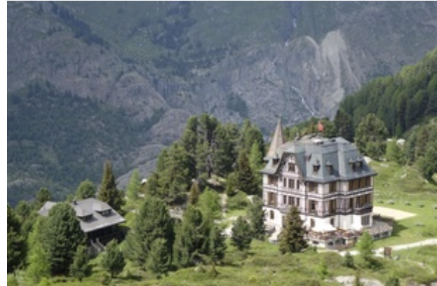
The Villa Cassel (home to the Pro Natura Aletsch Centre) with the Aletsch Glacier in the background (1912 and 2016)