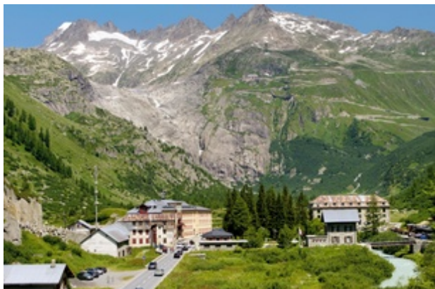
The Rhône Glacier in 1855 and in 2010